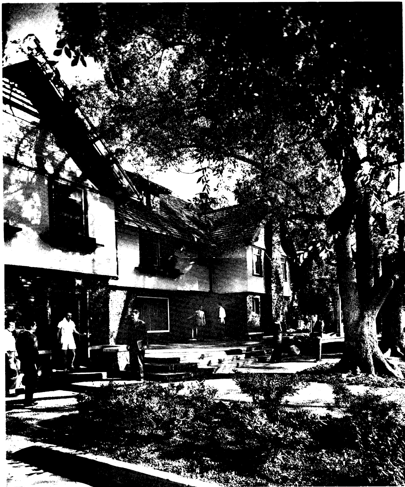
MANOR DEL MAR—the men's student residence. The ENVOY brings you a personal reminder of our young people and of the Ambassador Campus. Its hundreds of pictures—like this one—show how students work and live.